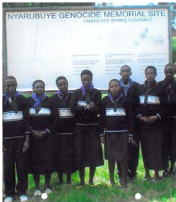
Visiting the Nyarubuye Genocide Memorial in Rwanda

Young people became more respectful of cultural and social diversity and respect for the rights of each human being regardless of ethnicity, gender or religion. Boys and girls helped each other and interchanged roles and tasks.