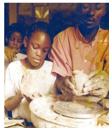
Learning traditional crafts: Pottery workshop