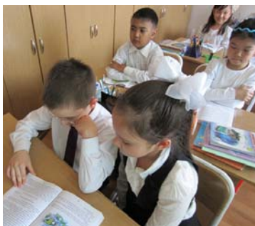
Reading and listening to a poem in Kazakhstan

The aims of intercultural education also complement the four pillars of education as identified in Learning: The Treasure Within , Report to UNESCO of the International