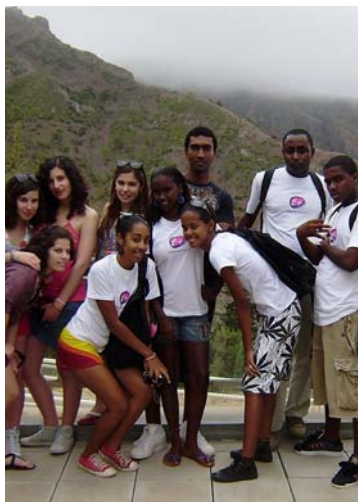
Making new friends through the project

This project contributed to the celebration of two important International Years and made a significant link between science and culture. Although these years have both