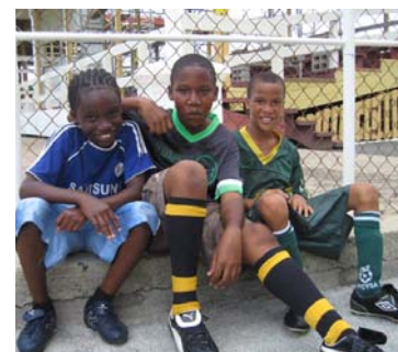
Learning to live together through sport in Trinidad and Tobago

The initiatives presented were carried out by young citizens and their teachers at the grassroots in all regions of the world, in public, private, rural and urban settings. They contributed substantially to the priorities of the International Year for the rapprochement of Cultures. The selection of projects was a challenge: the criteria included innovativeness, impact, and – especially – the multiplier effect.