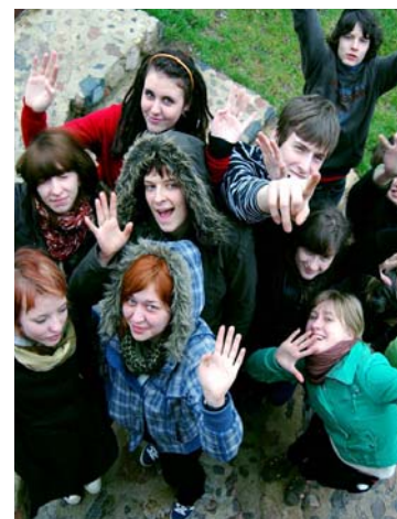
Intercultural workshop

This project is a good example of fruitful collaboration between education and the non-formal sector, i.e. working with non-governmental organizations. It was also very