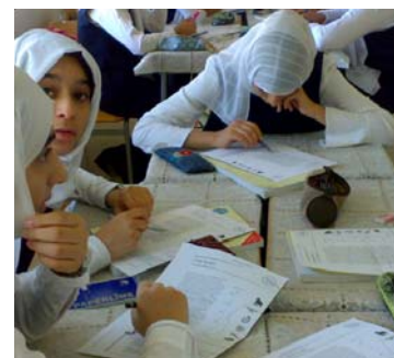
Omani students learn about their partner country

In planning an intercultural dialogue with a school in another part of the world, work with your partners to choose a topic of global concern and interest. Most countries are faced with the issue of the rational use of water and the need to protect biodiversity. While dealing with such concerns, students in both countries deepen their knowledge and commitment to take action locally but also achieve a broader vision of how these challenges are tackled elsewhere. Young people also understand better the cultural context of the country under study and the intrinsic link between culture and the environment.