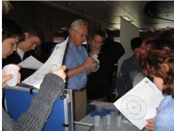
Teachers from different European countries unpack new resource material