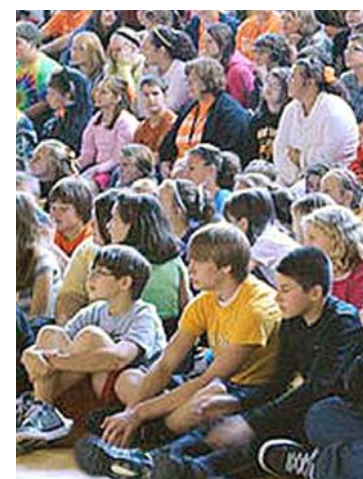
Students witness the naturalization of over 500 U.S. citizens