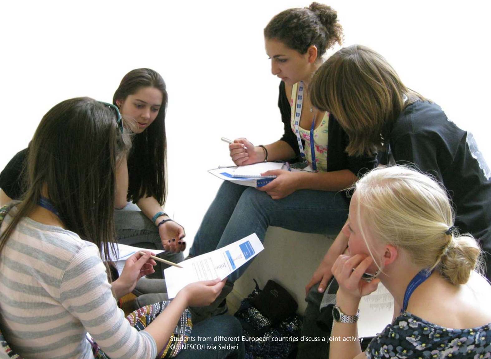
Students from different European countries discuss a joint activity