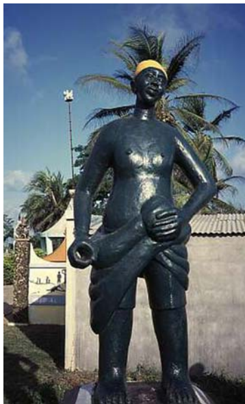
A statue on the Slave Route in Ouidah, Benin