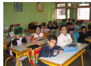
Classroom in Morocco

Just as the cook tastes and checks the dishes under preparation, assessment is an important dimension of any educational initiative and should be built into the planning and implementation phases. Since intercultural dialogue not only deals with