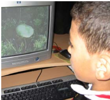
Young boy using ICT

Due to cultural contexts and specificities where education takes place, there can be no recipe for intercultural education where "one size fits all". However, the basic ingredients as illustrated in this collection can provide a useful reference point. It is now up to each school to plan and embark on intercultural dialogues and exchanges so that children and young people can contribute to enabling the people of the world to live together in peace and in dignity.