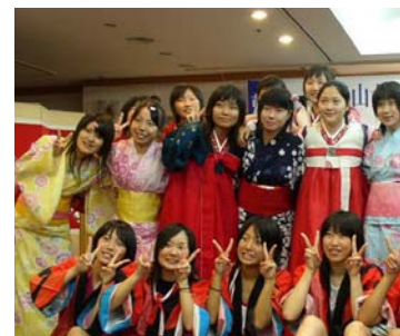
Students from the Japanese partner school in full regalia