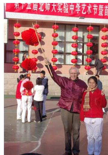
International exchange programme