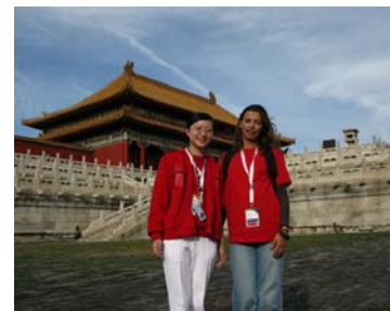
Sharing China's cultural heritage with visitors from around the world

Students became more tolerant, open and respectful towards others.