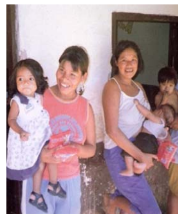
Visiting a Mbya-Guaraní community in Paraguay

Obstacles were overcome by concentrating on the attainment of objectives and involving young people and families in seeking strategies to solve eventual problems. The economic support provided by the government through the National Fund for Culture greatly facilitated the running of the project.