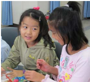
Japanese students

Intercultural learning places a strong emphasis on values, as knowledge without values cannot lead to dialogue and exchange across cultures. Positive and constructive action especially requires values. Many of the good practices emphasized the transmission and reinforcement of values, in particular the concept of learning to live together in