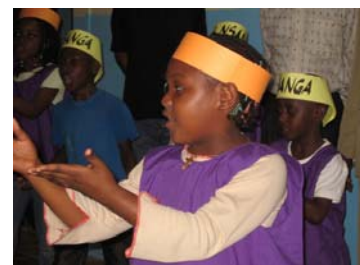
Children in Gabon perform a cultural song

ASPnet helped to pioneer experiential learning through the promotion of practical projects with tangible results. Students can be invited to form teams and working groups whereby each one is given a specific role and responsibilities.