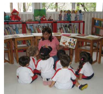
Kindergarten children in Brazil listen to a story

Time and again projects drew attention to the changes in attitude which occurred not only in students, but in teachers, parents and decision-makers. A number of projects brought out the best in students including those with learning difficulties. Children and young people have become more open-minded and interested in other cultures and lifestyles and have committed to combating prejudice, stereotypes and discrimination. They are less likely to judge people based on their looks, language or