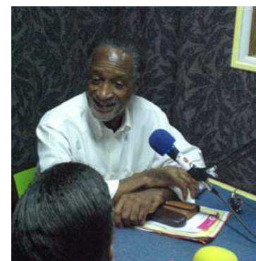
A guest from Montserrat participates in the radio interview