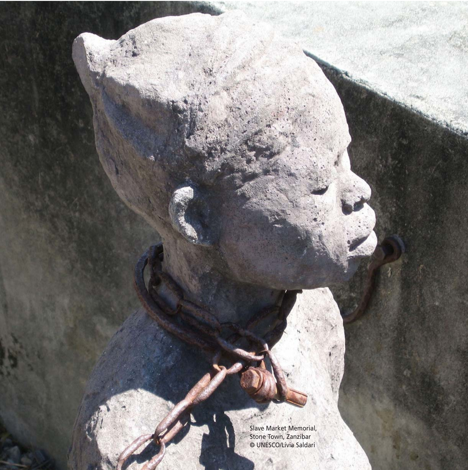
Slave Market Memorial, Stone Town, Zanzibar