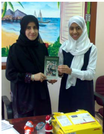
Sending and receiving resource material from a partner school

There were a few practical obstacles, but involvement of parents and the media helped to overcome them.