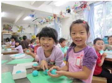
Japanese students during an art class