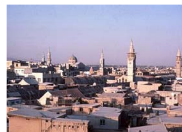
The Ancient City of Damascus