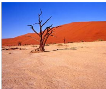
Desertification © Mirella Saldari

Some expenses were involved in producing the joint magazine but the school principal helped with fundraising. Finding extra time for joint projects was also a factor, so some activities were conducted during breaks or after lessons.