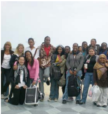
Students from Trinidad&Tobago and Spain established a partnership

Students learned how to conduct research by taking notes, preparing and conducting interviews with specialists and collecting and analysing information. They became competent in the use of Power Point presentations and gained confidence in speaking in front of an audience. Leadership skills were developed; teachers became facilitators which enabled the students to be the prime actors. Students learned about effective fund-raising, essential to any project. The Spanish students also improved their English language capacity.