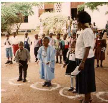
Children express themselves through role play

Attitudes of empathy and solidarity are formed at a very early age. In a multicultural country like Cameroon, emphasis was therefore placed on respect and appreciation of differences and the elimination of any sort of prejudice or discrimination. With very young children, teachers highlighted the linguistic and cultural specificities of each ethnic group represented in each classroom. The children learned many key words and idioms as well as their cultural significance. Through dance and music, they became familiar with the rich cultural diversity of their classmates. Older students were introduced to crafts made by different regional ethnic groups and were given the possibility of producing their own artwork. The project was conducted as part of the curriculum in language classes, civic education, and geography. Some of the initiatives were extended and reinforced as extra-curricular activities. Every year the project culminates in a gala evening with the presentation of clothing, fabrics, accessories and