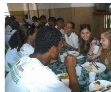
ASPnet students from Portugal and Cape Verde