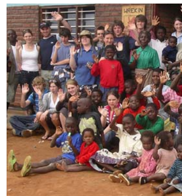
Students from Malawi and the UK developed educational resource materials on HIV and AIDS