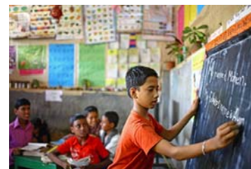
Learning in Bangladesh at the Unique Child Learning Center

Such a project is relevant to the needs of the community and complements the curriculum. Positive changes have been made in the school environment and contribute to the promotion of peace.