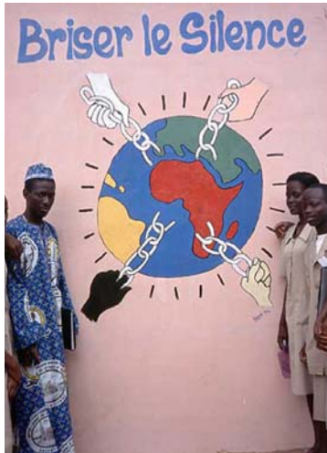
"Breaking the Silence" Project in Benin

http://www.unesco.org/new/en/education/networks/global-networks/aspnet/flagship-projects/transatlantic-slave-trade/