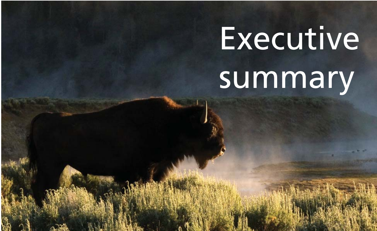
Yellowstone National Park, United States of America